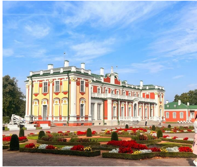
View from my Accommodation